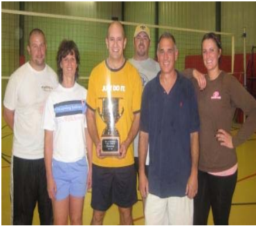
NORTH LAKE BOMBERS

contact Sable Williams at 985-277-5905 or williams_sl@hammond.org .