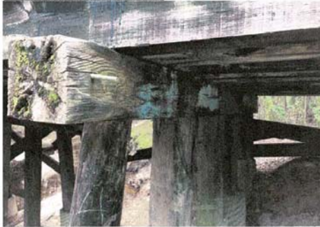
bent 4 cap