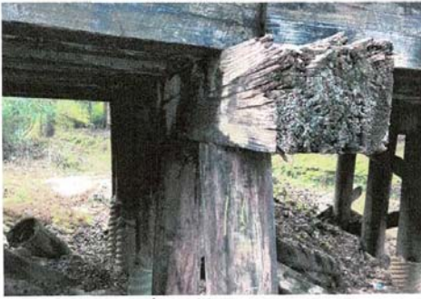
bent 11 cap