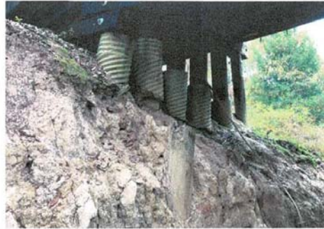
bent 4 scour